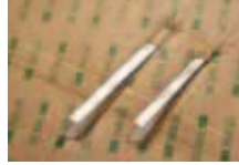
CONNECTION: SOLDERING RIBBON