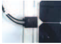
CONNECTION: JUNCTION BOX