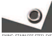
FIXING: STAINLESS STEEL EYELETS